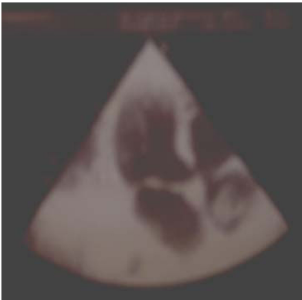
Figure 1 Echocardiography of a right atrial mass, 2 × 2 cm, attached to the atrial septum.

During her nursery, it was observed that she had steadily worsening thrombocytopenia and prolonged aPTT, so more thorough blood tests were done as far as coagulant disorders are concerned. Based on lupus anticoagulant (LA) positivity, anticardiolipin (aCL) antibodies and \beta_2 GPI remarkable elevated, the diagnosis of antiphos-